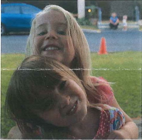
New best friends & two families of 4 that secured housing.