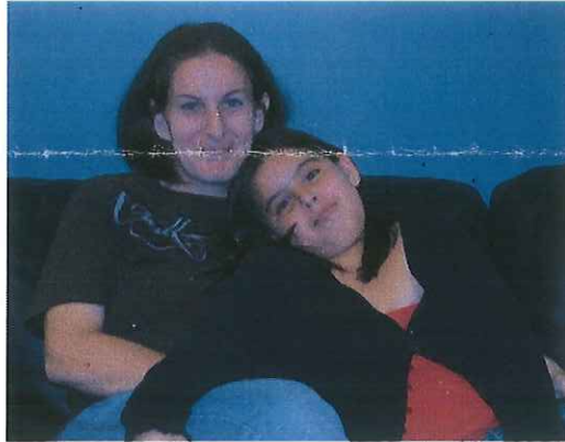
Family of 3 who secured housing in 2012.