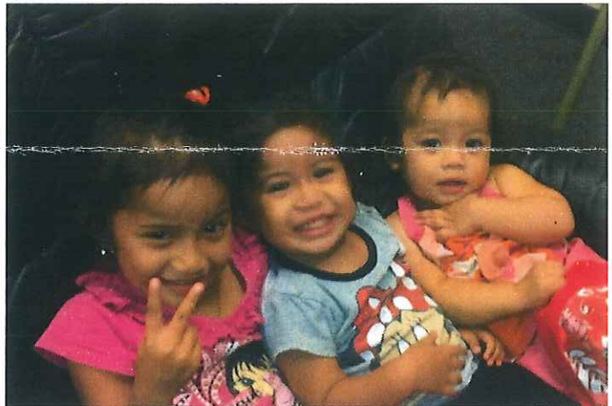
Three beautiful girls whose families secured housing in 2012.

Mahalo for helping to make it all possible!